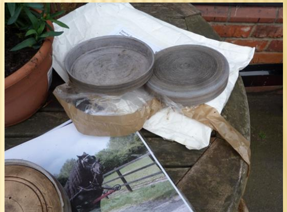
New leather cup washers for the split pistons.