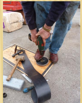
Drilling centre hole in washer ready to fit connecting rod