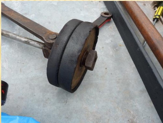
Old cup washers