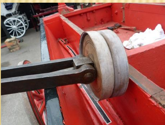
New washers fitted and piston ready to fit to bores