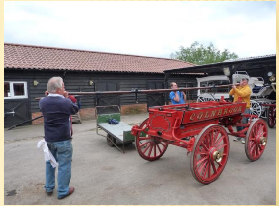
Pump levers being lifted back on