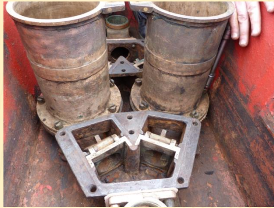
Pump body being re-fitted