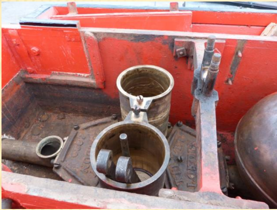
Pistons going back in

Work starts on the Shand Tilley pump. Built in 1839 and probably not used since 1900 or taken apart until 2016