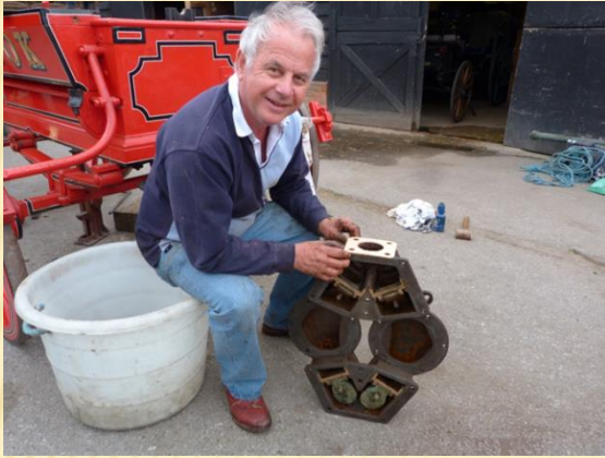
New gasket being fitted to the valve chamber, inlet port.

Work starts on the Shand Tilley pump. Built in 1839 and probably not used since 1900 or taken apart until 2016