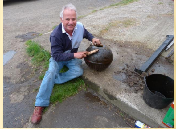
Pressure vessel being cleaned