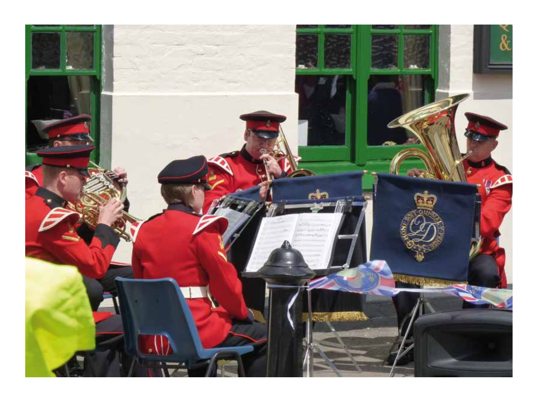
The Minden Band of The Queens Division