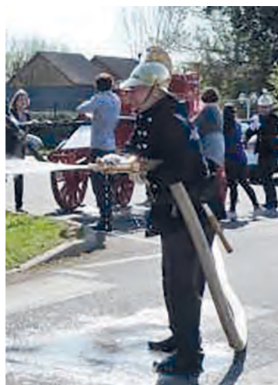
The Colnbrook Fire Tender in action with school staff, in the background, helping with the manual pumping.

Also during the week they arranged horses to take the 1832 Colnbrook Fire Tender to both schools and demonstrate its ability to put out a fire. The children were thrilled to see it and learnt a little bit about the history of Colnbrook.