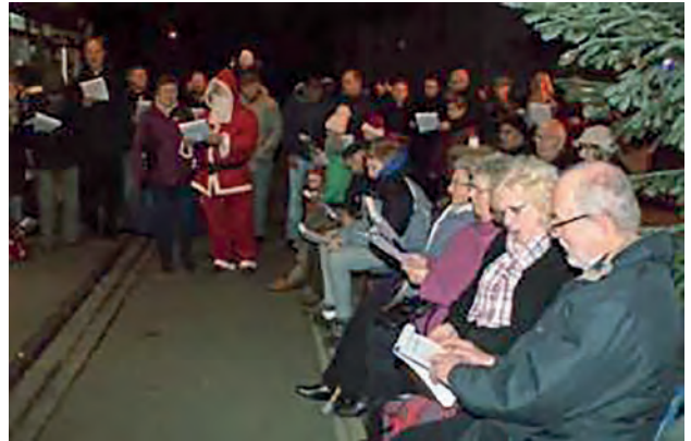
A previous Sing along.