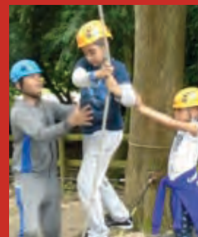
Our Years 5 and 6 residential trip to Green Park in June was a huge success!