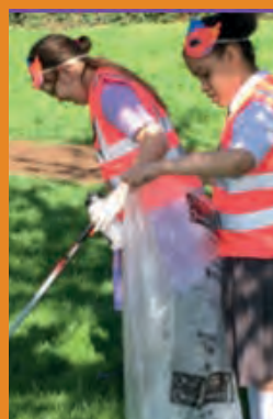
In April, Year 5 did a 'litter pick' for our community.