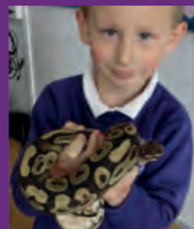
RepSmiles visited in May and brought some fantastic reptiles for the children to hold and learn about.