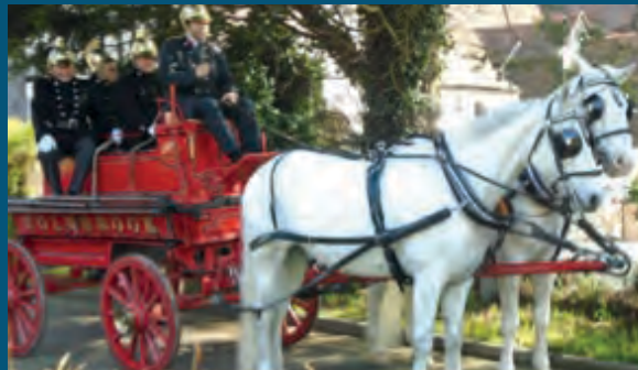
After Easter, members of the Colnbrook Residents' Association visited us with the Colnbrook Fire Tender – a fabulous morning!