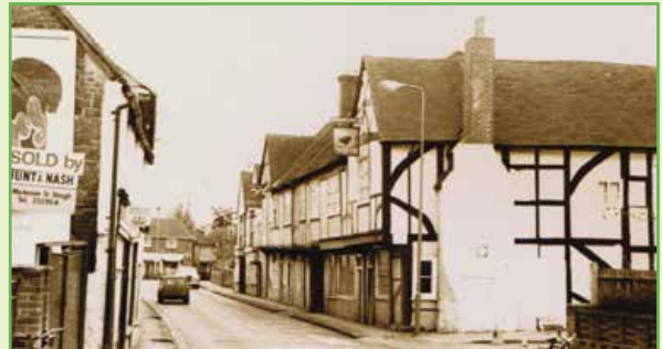
Circa 1973 – The Ostrich Inn