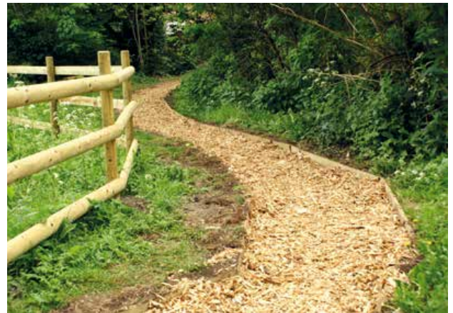
The new path from Bath Road