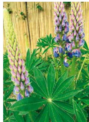
L-R Chives, Celery, Tarragon and Sage, Lupin