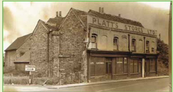
Circa 1949 – Platt's Store