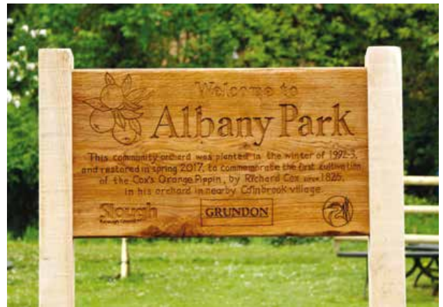
Signage defining the park.

In this form of collaboration we have, since 2006, been instrumental for sourcing funding to provide improvements to green spaces in Colnbrook for both our residents and for local wildlife. We have provided funds to install sport and recreational equipment for both our own Recreation Ground and Pippins Park, an asset of SBC. We have also upgraded Westfield Hall and provided a funding stream to assist with the upgrade to Colnbrook Village Hall.