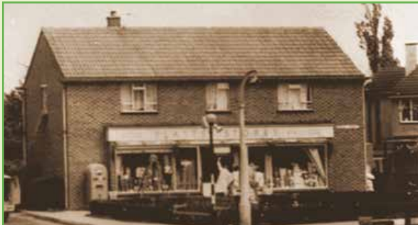
Circa 1963 – Market Square