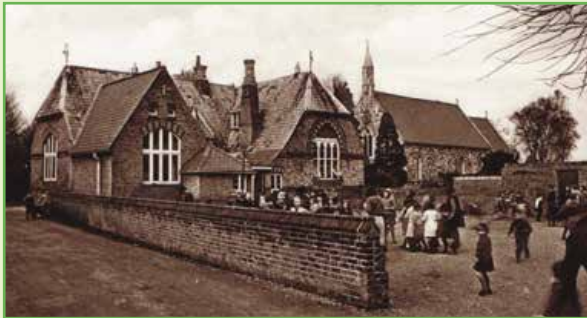
Circa 1936 – Colnbrook Church of England School

The Parish Council has recently been compiling a library of historical pictures of Colnbrook through the years. These are some of our favourites: