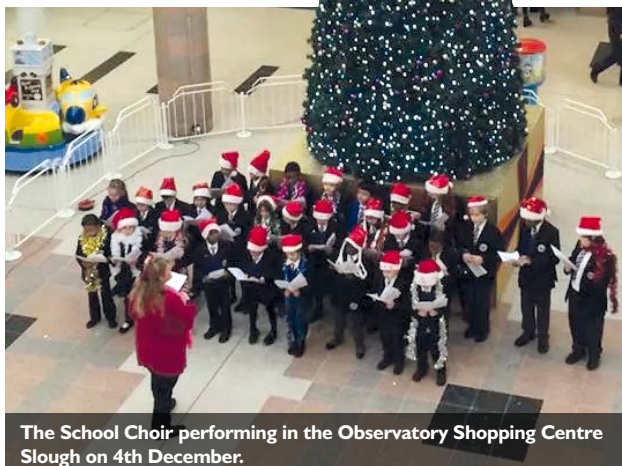
The School Choir performing in the Observatory Shopping Centre Slough on 4th December.