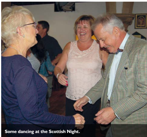
Some dancing at the Scottish Night.