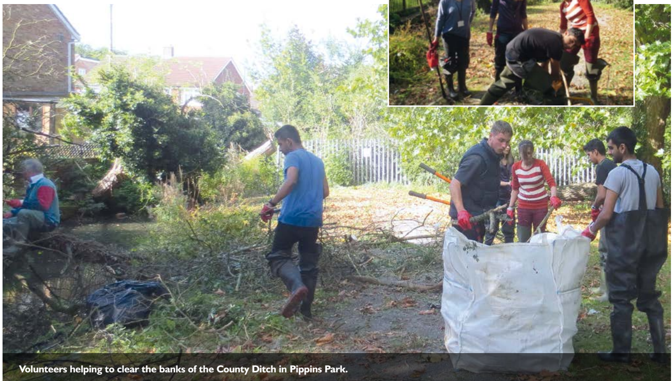
Volunteers helping to clear the banks of the County Ditch in Pippins Park.

Members of the Parish Council, The National Flood Forum and the Colnbrook Residents Association have worked with volunteers from DHL under the direction of Groundwork Thames Valley clearing rivers and banks of potential blockages. The E.A. have also been clearing larger obstacles and debris although often this is the responsibility of the adjacent landowners.