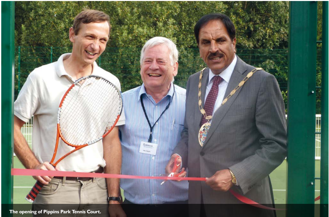
The opening of Pippins Park Tennis Court.