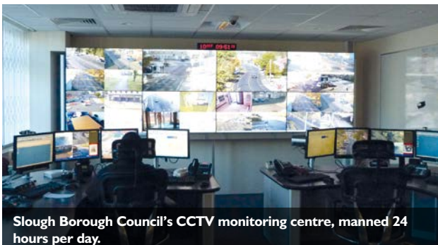
Slough Borough Council's CCTV monitoring centre, manned 24 hours per day.