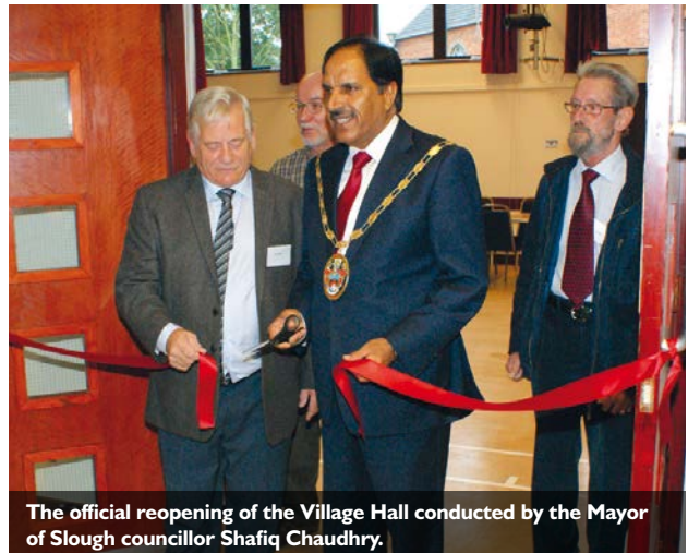
The official reopening of the Village Hall conducted by the Mayor of Slough councillor Shafiq Chaudhry.