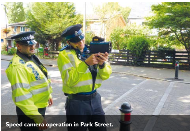
Speed camera operation in Park Street.

Drivers throughout the Thames Valley area are urged not to leave their vehicles unattended with the engine running on frosty mornings. Opportunist thieves could be on the lookout to take advantage of such a situation. It only needs a moment for a thief to jump behind the wheel and drive off in your car. Even if the door is locked, a thief will not think twice about smashing a window to get in. The simple message is not to leave a running car unattended for any length of time, whether it is left on your own driveway to de-ice on a cold winter morning, or for example while you pop to post a letter or pay for fuel. Give yourself extra time to defrost all your cars windows and don't be tempted to leave the car even for a few moments. A car unattended with its engine running is a golden opportunity for a thief. As well as causing a huge amount of upset and stress, this type of theft can also result in your insurance company refusing to settle the claim because the vehicle was left insecure. You could potentially lose thousands of pounds. You can watch a video on our Thames Valley Police YouTube