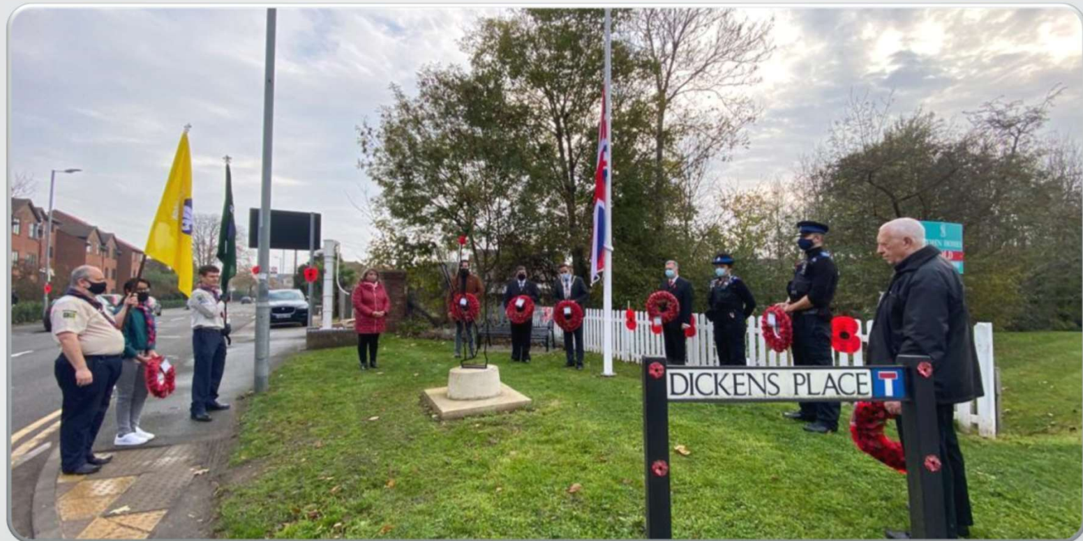
Remembrance Day Observed - 2020