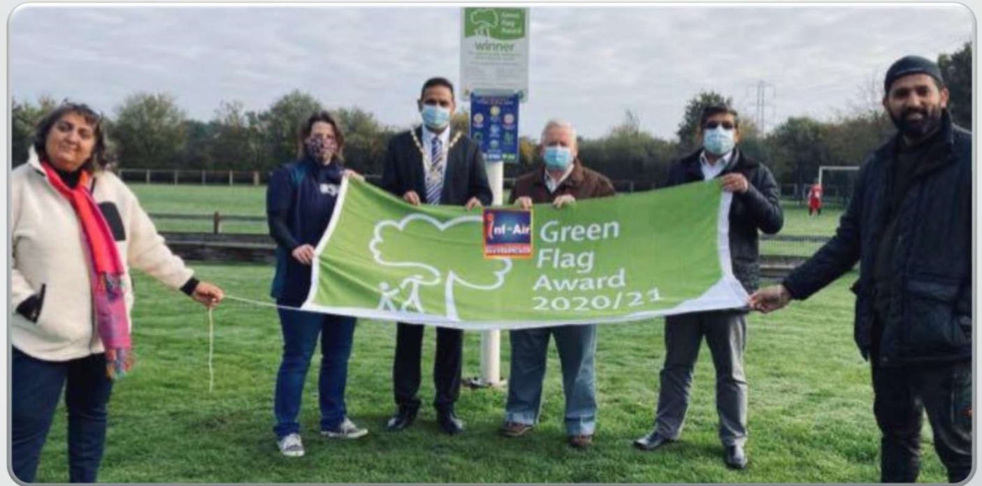
Winning of Green Flag Award 20/21