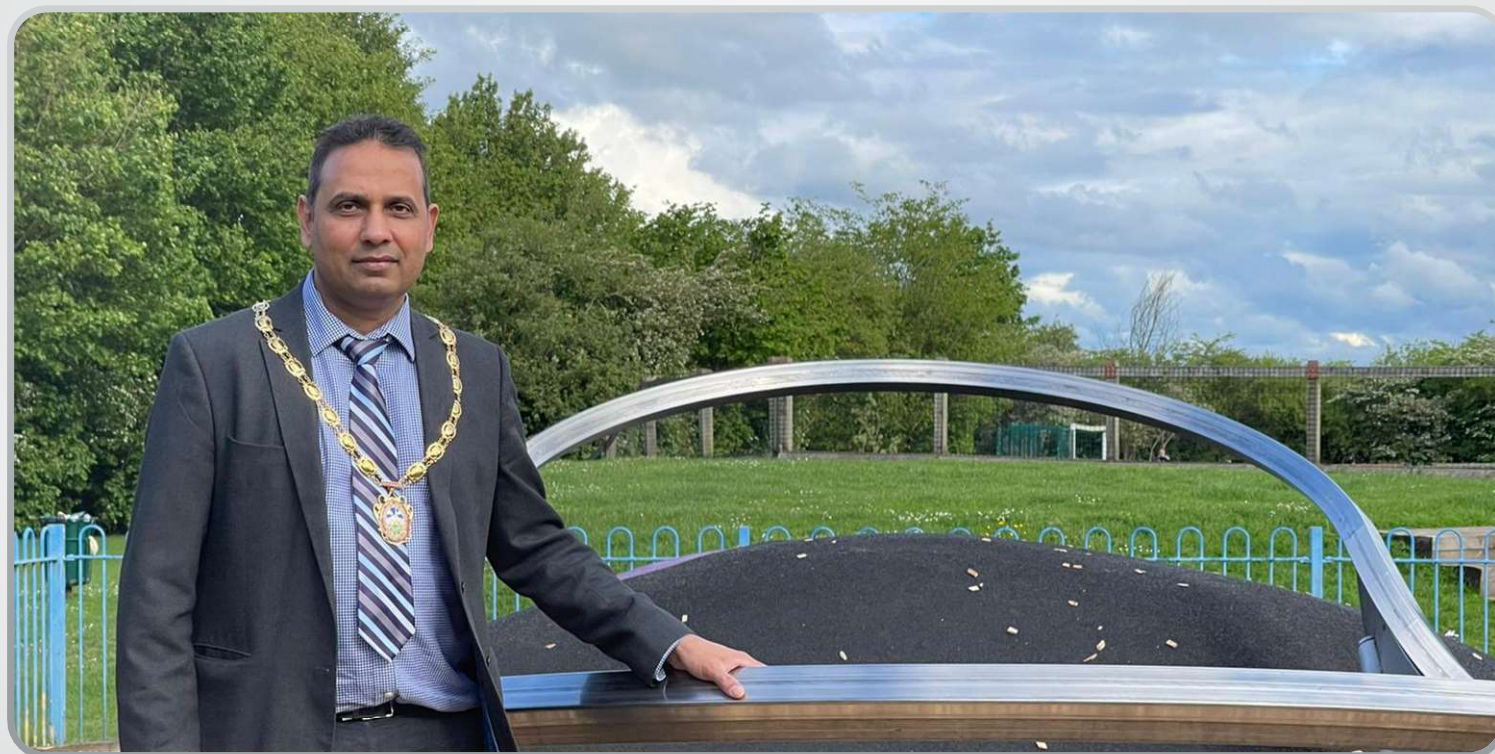
Recreation Ground Ridge Rider Repaired