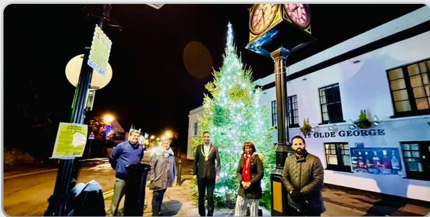
Christmas Lights with Extended to 5 Trees