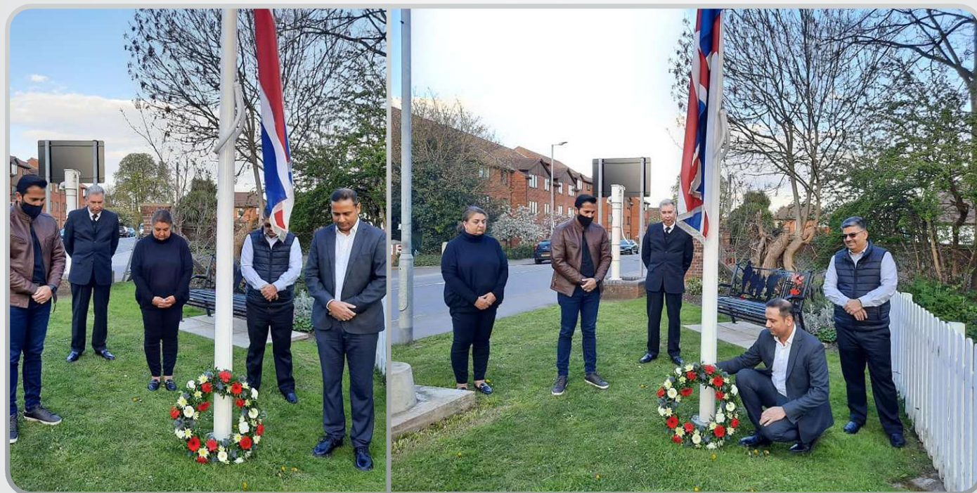
Farewell to HRH Prince Philip Duke of Edinburgh